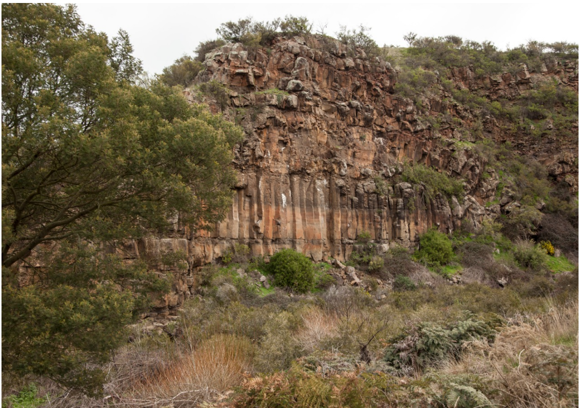
The Devil's Kitchen today, but once at the heart of the Springdallah gold fields.