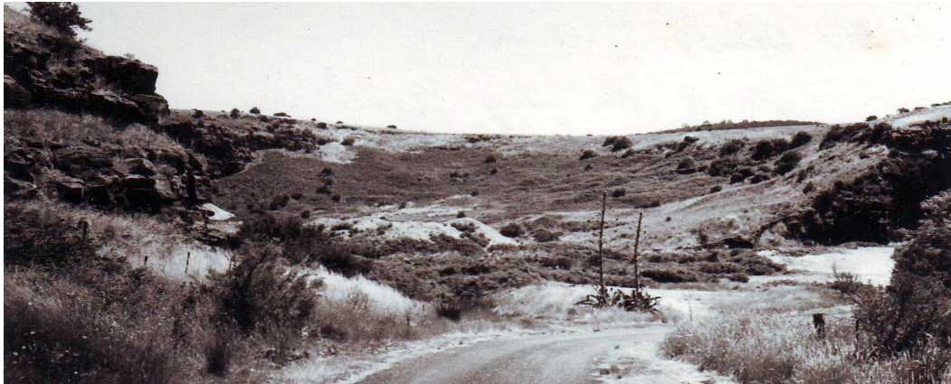
The same view as above a century later