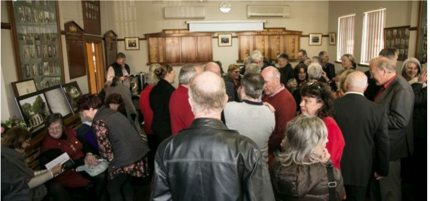
Society members and other guests discussing Linton Makes History