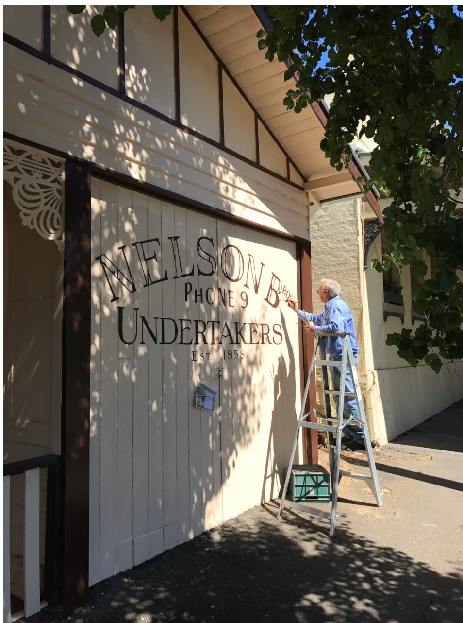
Sign writer at work on the Nelsons' Undertakers sign on Monday 20 February 2017